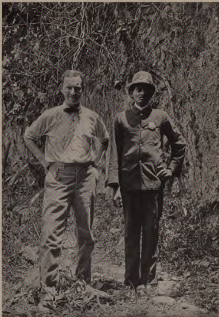
A Panamanian Policeman and a Z. P. "gum-shoe"